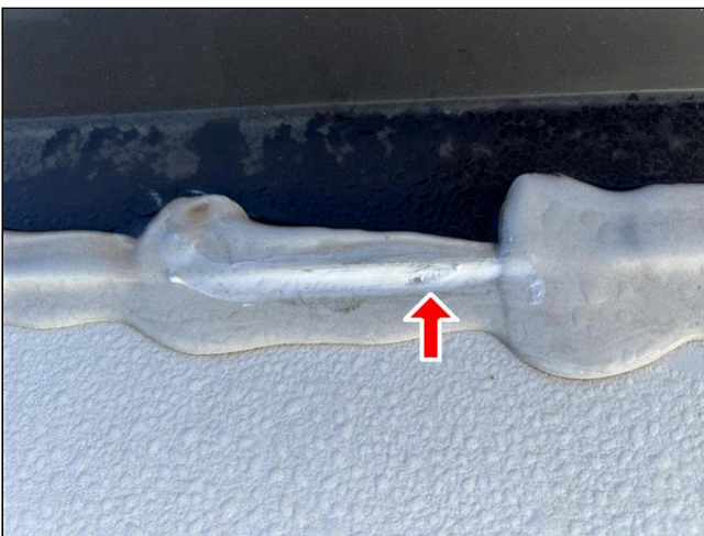
Right Side of Skylight