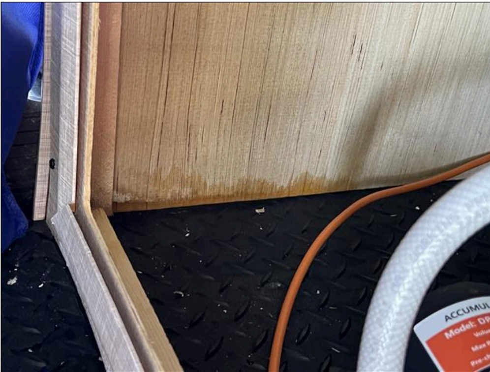
Water intrusion on paneling near Accumulator