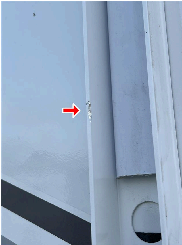
Curbside Front Awning Frame

The curbside front awning has an indentation in the frame. It is recommended that this be further evaluated by a qualified RV Technician.