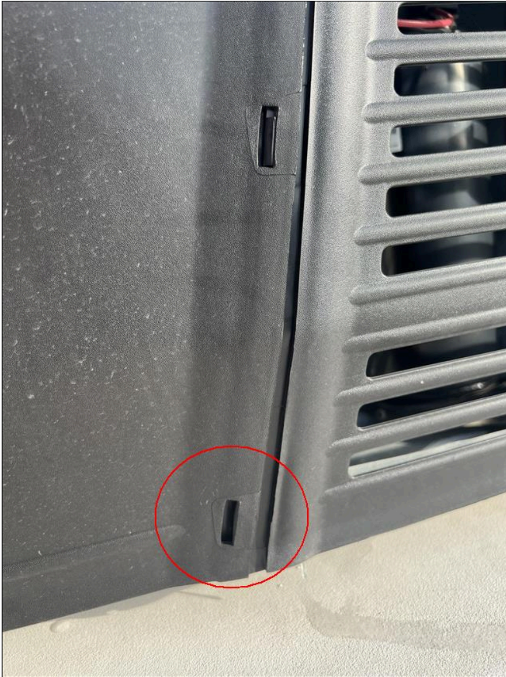
Streetside Rear AC Shroud

The streetside rear AC shroud's bottom clip is not connected. This is a LIFE SAFETY ISSUE. It is recommended that this be further evaluated by a qualified RV Technician.